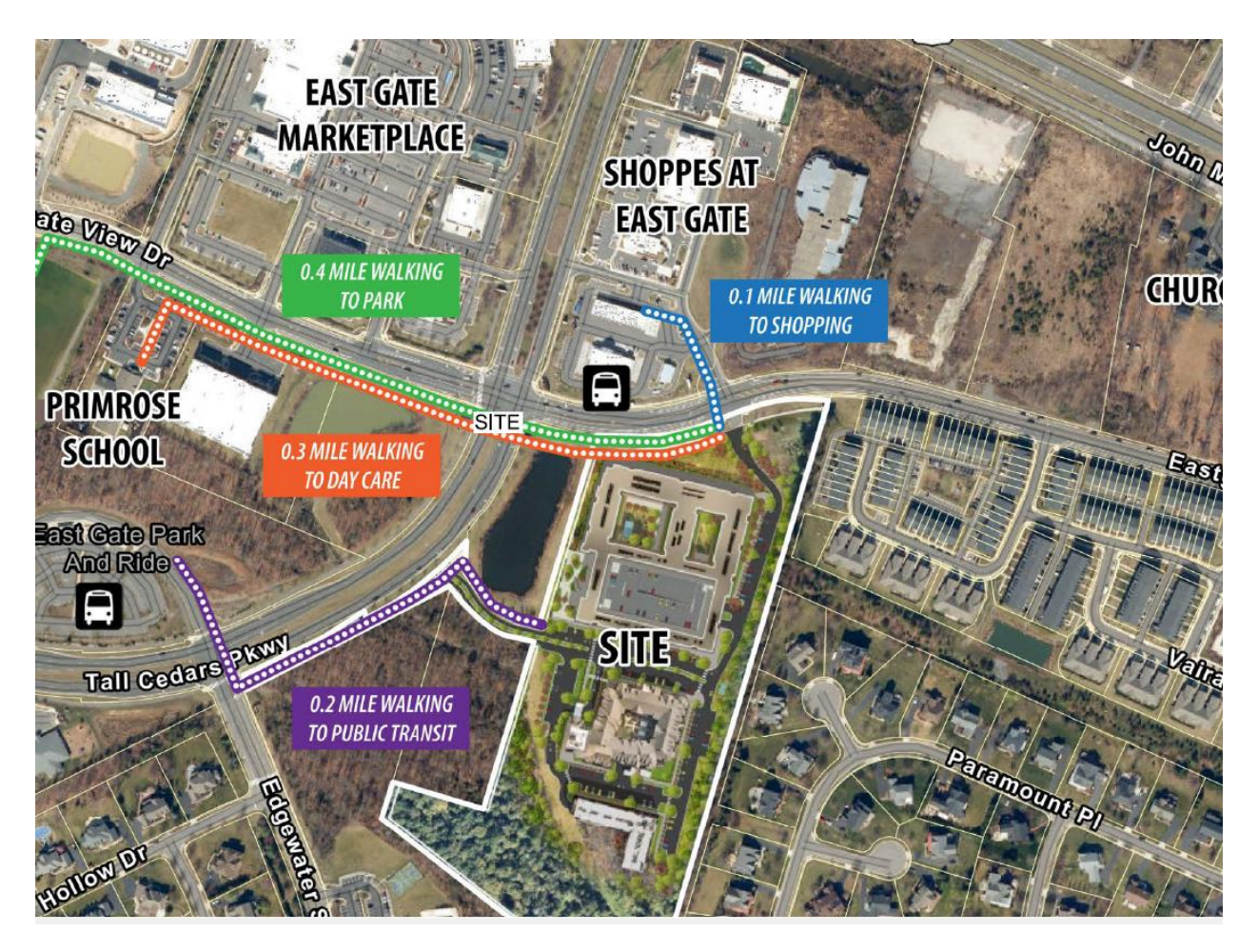
March 25, 2024 – According to our research this zoning amendment is in process at the Staff level with Loudoun County, several iterations and public hearings are expected prior to review and decision by the Loudoun County Board of Supervisors late this year/early next.