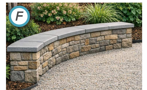
F SEATWALL GARDEN SEATWALL AND GRAVEL PATHWAY