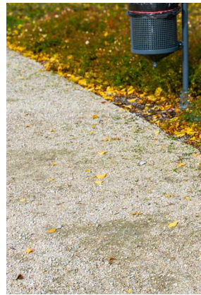
GRAVEL PATHWAY DECOMPOSED GRANITE