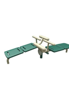
INCLINE SIT-UP GREENFIELDS OUTDOOR FITNESS