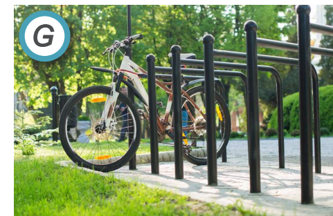
G BIKE RACKS BIKE RACKS AND CONCRETE PAD