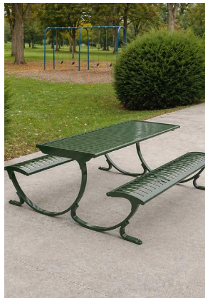
PICNIC TABLES - METAL DUMOR 464 (6')