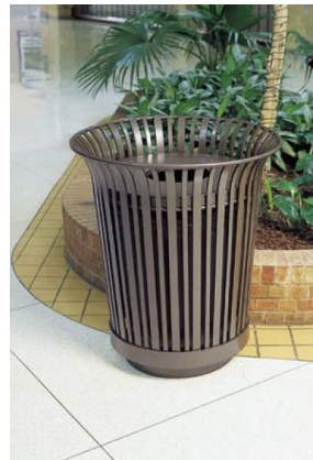
TRASHCAN - METAL DUMOR 107 (32 GAL)