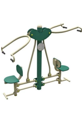
LAT PULL/PRESS GREENFIELDS OUTDOOR FITNESS