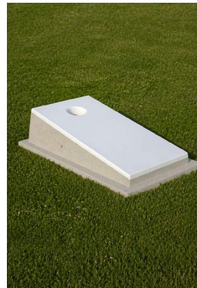
CORNHOLE BOARDS CUSTOM CONCRETE BOARDS