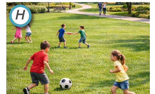
H OPEN PLAY TURF GRAND LAWN