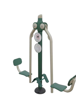
LEG PRESS GREENFIELDS OUTDOOR FITNESS