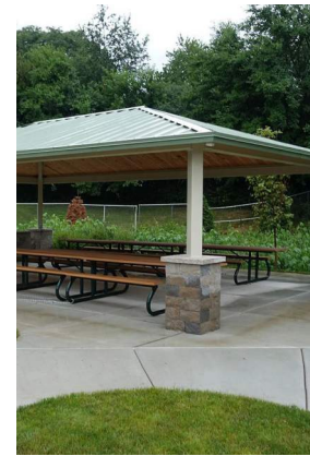
PAVILION WITH STONE COLUMN BASES CUSTOM BUILT