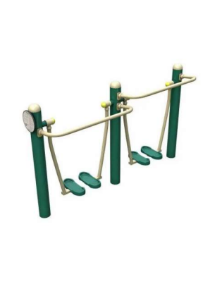
AIR WALKER GREENFIELDS OUTDOOR FITNESS