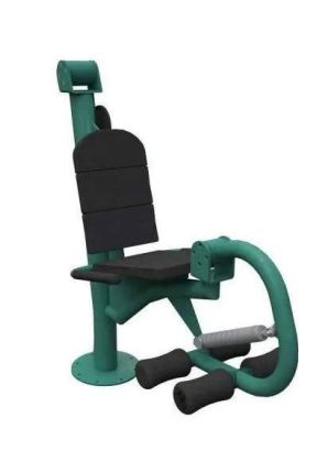
LEG EXTENSION CURL GREENFIELDS OUTDOOR FITNESS