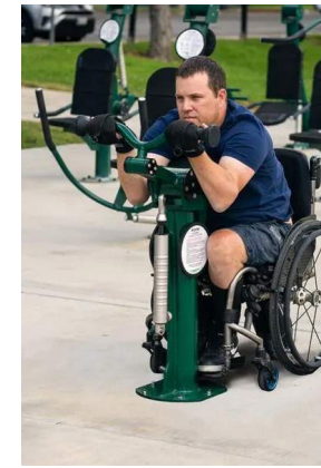
ARM CURL GREENFIELDS OUTDOOR FITNESS