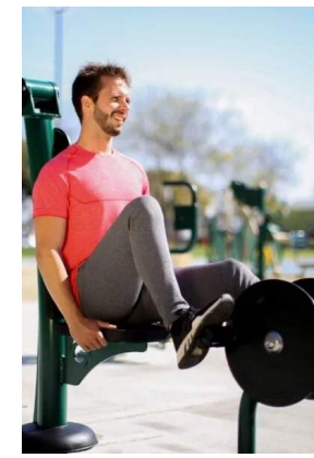
RECUMBENT BIKE GREENFIELDS OUTDOOR FITNESS