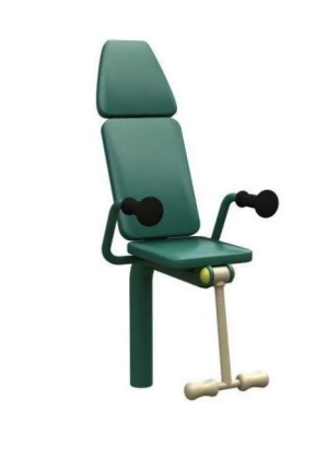
LEG EXTENSION GREENFIELDS OUTDOOR FITNESS