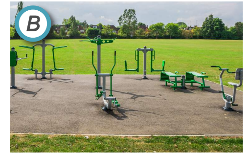
B FITNESS AREA FITNESS STATIONS AND POURED-IN-PLACE (PIP) SURFACING