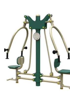
CHEST PRESS GREENFIELDS OUTDOOR FITNESS