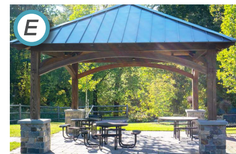
E PAVILION SEATING PICNIC TABLES, TRASHCANS, AND PAVILION