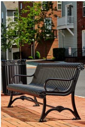
BENCH - METAL DUMOR 58 (6')