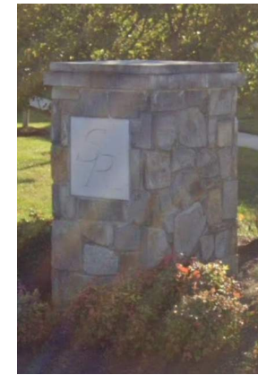
SOUTH RIDING COLUMNS REFERENCE IMAGERY