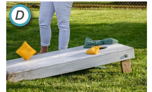
D ACTIVITY LAWN SYNTHETIC TURF