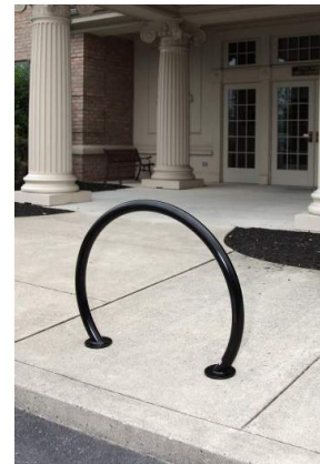
BIKE RACKS - OPTION ONE DUMOR 292 (39 LBS; SURFACE MOUNT)