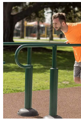
PARALLEL BARS GREENFIELDS OUTDOOR FITNESS