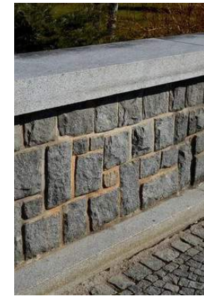
SEATWALLS STACKED STONE & CONCRETE CAP