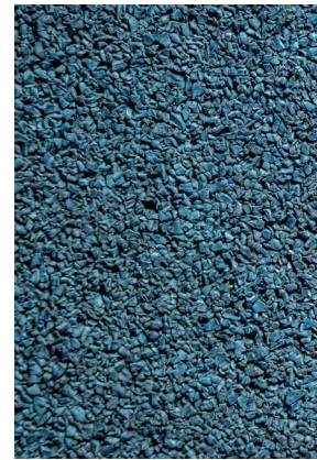
POURED-IN- PLACE (PIP) RUBBER SURFACING