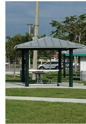
PAVILION ALL METAL POLYGON RECTANGLE