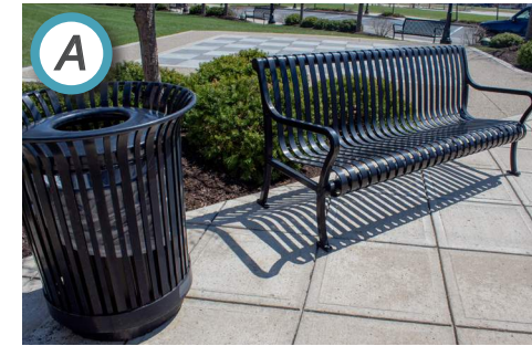
A SEATING AREA BENCH AND TRASHCAN