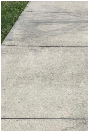
CONCRETE PATH STANDARD BROOM FINISH